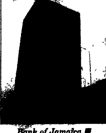
Bank of Jamaica ■